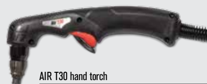
AIR T30 hand torch