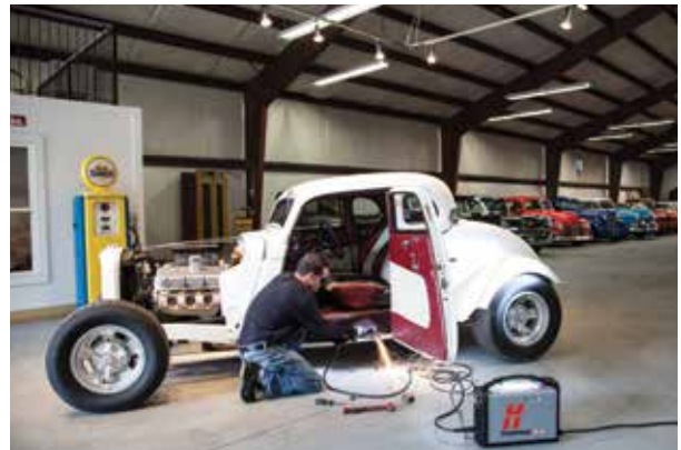
Vehicle repair and modification