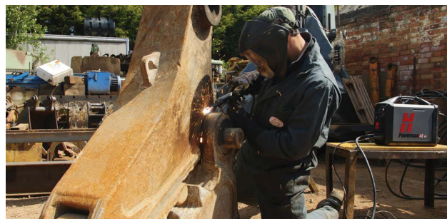
Maintenance and repair